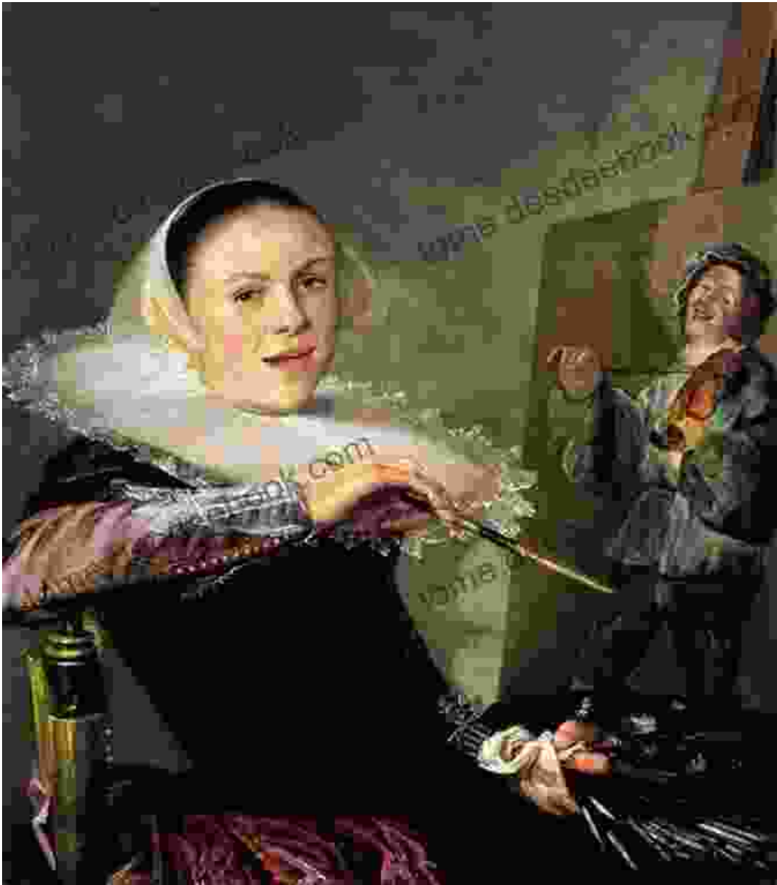
34 Amazing Color Paintings of Judith Leyster - Dutch Golden Age Portrait Painter (July 28, 1609 - February