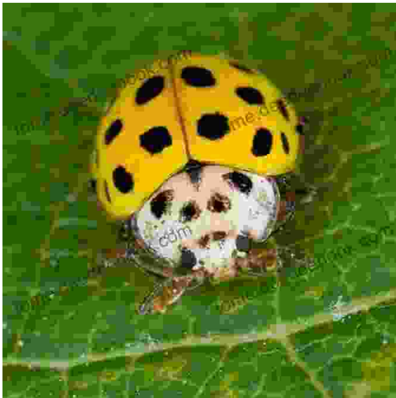
A striking yellow ladybird with black spots, demonstrating the species' diverse coloration.